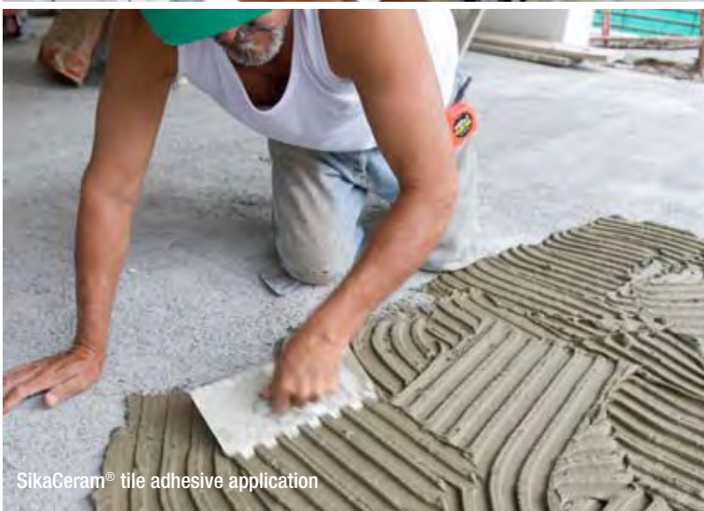
SikaCeram® tile adhesive application